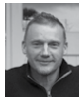
ANIMALS LIKE US www.animalslikeus.co.nz