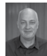
NEW ZEALAND STORY www.nzstory.govt.nz

Internationally recognised law firms MinterEllison and MinterEllisonRuddWatts span the Tasman and have been strategically aligned for more than 30 years. The firms collaborate to provide trusted, seamlessly integrated legal solutions to their clients, across Australia, New Zealand, and the broader Asia Pacific region.